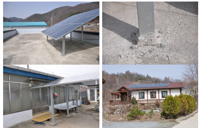
Fig. 2. Condition of the surveyed facilities

This insufficiency evidences that no proper and enough preparation is made when a builder make a plan and starts construction. It is very essential to place the size, shape and direction of a house in consideration for installing PV power system. Particularly, it is required that installation of PV power system in an old house should be considered and analyzed in the